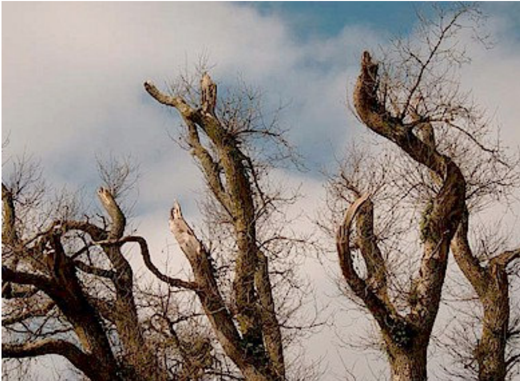
response (Melbury Park, Dorset)

Among environmental arborists there is a growing interest in the interaction between tree colonising species and possible co-evolutionary relationships (Fay 2000). Interactions between trees and the species that live on them may have developed over exceptionally long periods of time, and as some trees may be several thousands old, speculation therefore may extend to the relationships between tree longevity and the continuity of the continuity of the organisms living on and inside the tree, and those living underground that are associated with the rhizosphere. Over recent decades there has been a prejudice against dead wood in arboriculture, forestry and agriculture. This is now being redressed with a developing new trend to value biodiversity and to promote arboricultural practices that retain and even create variations in dead wood