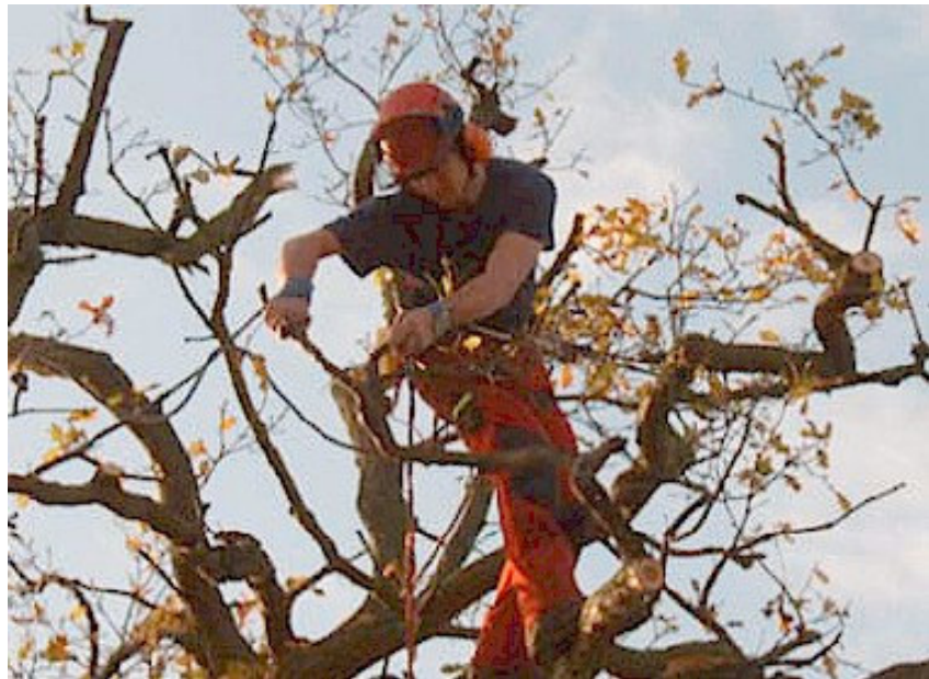
Crown retrenchment pruning on Quercus robur at Hatfield Forest, Sussex.